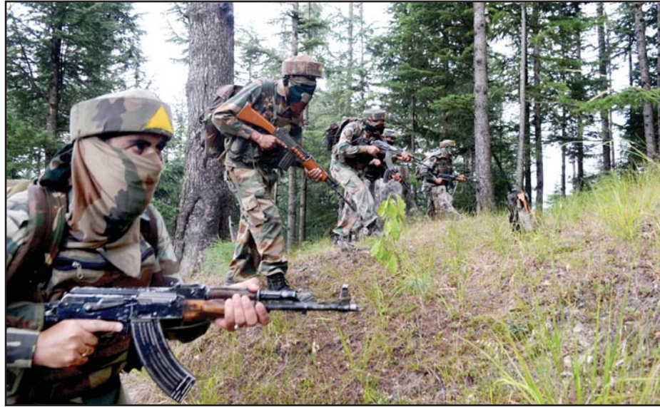
Army jawans in action during encounter at Hafrooda in Kupwara on Thursday.

tion was launched on July 29 when the security forces received intelligence based information about the presence