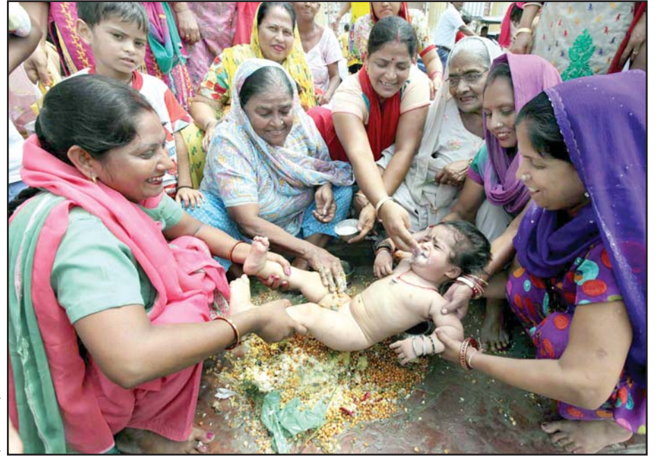
Women perform rituals for the long life of their sons on Sunday on the occasion of 'Baccha Dua', a tradition followed in Jammu.

"This time also, the situation is almost same. Five years have