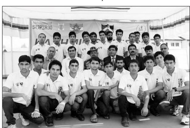
Students posing alongwith dignitaries at Srinagar on Thursday.