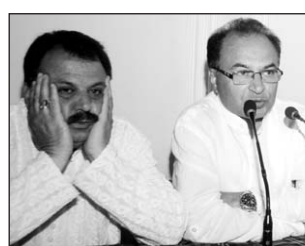
Jammu and Kashmir Film Markers and Artists Cooperative and Television Professionals United Forum addressing a press conference at Srinagar on Thursday.

field functionaries in rural areas to motivate and create awareness among rural population especially farming community so that they shift towards latest technology rather than old conventional agricultural practices. He said that there is a huge scope of development of agriculture and other allied departments in the region. He asked the officers to provide best and high breed disease resistant variety of seeds to the farming people in the district so that the poor people get enhanced economic benefits. DDC underlined the need to provide exposure and suitable platform to the farmers so that other farmers get motivated and adopt the latest agro-based technology in the region. He said that exposure and motivational result oriented visits/ tours needs to be organized for the progressive farmers so that they keep themselves abreast with the latest technological advancements in the field of agriculture and other allied sectors.