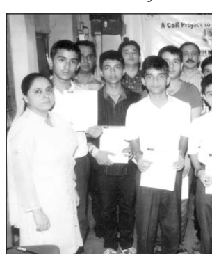
Students posing for photograph at free computer training programme organised by NIIT.