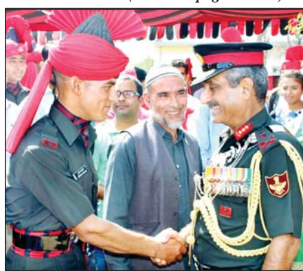
A Kashmiri youth shakes hand with an Army officer after passing out parade in Srinagar on Tuesday.