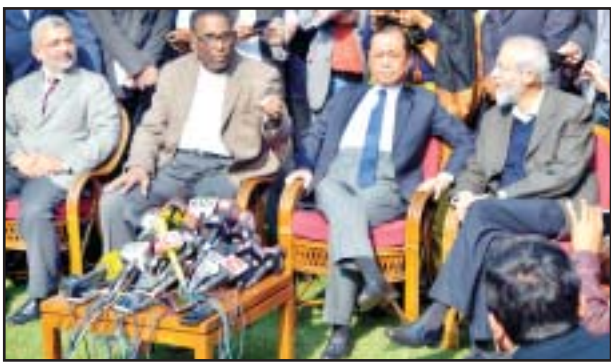
Four Judges of Supreme Court of India (L-R) Justice Kurian Joseph, Justice Jesti Chelameswar, Justice Ranjan Gogoi and Justice Madan Lokur addressing a press conference in New Delhi on Friday.

Justice Chelameswar himself described as an "extraordinary event" in the annals of the Indian judiciary when the Judges addressed a joint news conference during which he said "sometimes administration of