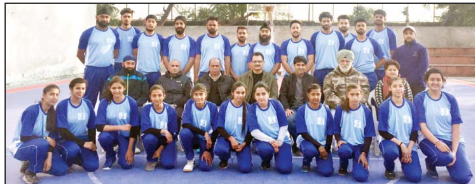
J&K Basketball teams posing for a group photograph before leaving for senior nationals.

Katra and dedicated the same for JKP, Para Military Forces and Indian Army martyrs and their families who sacrificed their lives defending the country from outside and within.