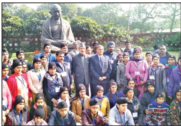
Students of 'Healthy India, Stronger India' posing along with former Chief Minister, J&K Ghulam Nabi Azad in Delhi.