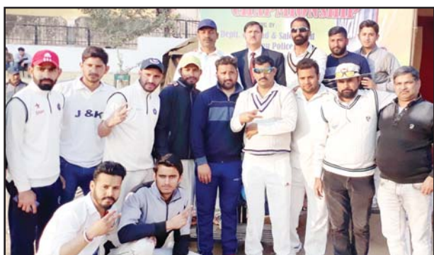
Winners posing along with officials at Parade ground in Jammu.

Students visited the monuments and places of religious importance in Delhi during the visit. Some of the places were Birla Temple, Qutub Minar, Gurudwara Bangla Sahib, Lal Quila, Indira Gandhi Memorial Museum, Jamia Masjid, Raj Ghat and India Gate.