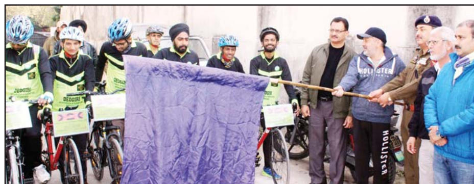
Minister for Sports, Imran Raza Ansari flagging off cycling expedition in Jammu.