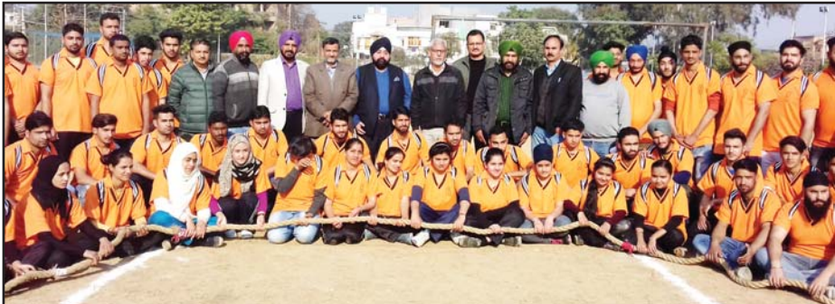
State Tug-of-War teams posing for a group photograph before leaving for Senior Nationals and Federation Cup.

Pakistan came into the game on the back of two victories over Bangladesh and Nepal.