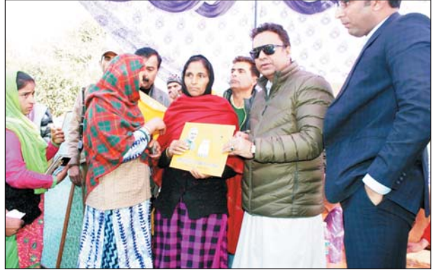
Food, Civil Supplies and Consumer Affairs Minister distributing free gas connections in Rajouri on Saturday.

RAJOURI, Jan 13: Minister for Food, Civil Supplies and Tribal Affairs today said that State is proud to take lead over rest of the States in the country in implementation of Pradhan