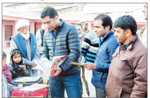
Deputy Commissioner Rajouri Shahid Iqbal Choudhary giving stationery to students on Saturday.

Students studying in Degree College were provided assistance of Rs 10,000, while those studying in Higher Secondary Schools and High Schools were provided Rs 5000 each. Similarly, students in Middle and primary classes were provided assistance of Rs 4000 each and pre-primary students Rs 3000 each. Books of various