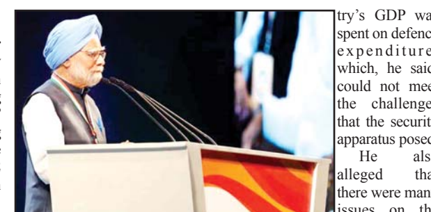
Former Prime Minister Dr Manmohan Singh addressing Congress' plenary session in New Delhi on Sunday.

From foreign policy and defence to the economy, the for-