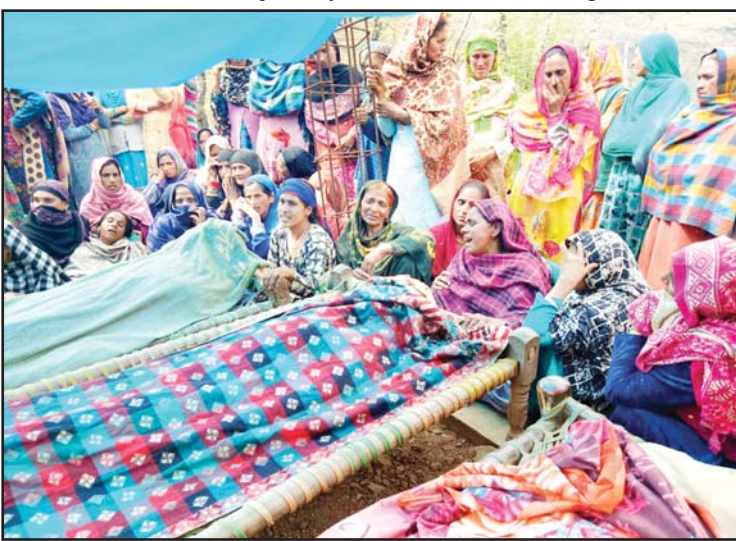
People wail over the bodies of Pakistan shelling victims at village Davitta in Balakote sector on Sunday. Another pic on page 6.

ed the victims to local hospital, where five of them were declared as dead while two injured sisters were referred to the District Hospital, Rajouri. Later, the injured were airlifted