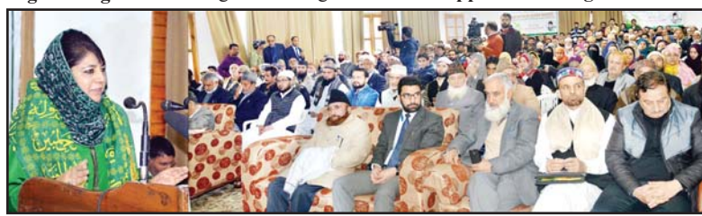
Chief Minister Mehbooba Mufti addressing religious scholars in Srinagar on Sunday.