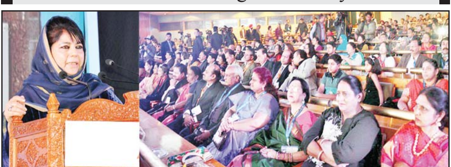
Chief Minister Mehbooba Mufti addressing TAAI convention in Srinagar on Tuesday.

tion is being held at Srinagar after a gap of 31 years. The last TAAI convention was held here in 1987.