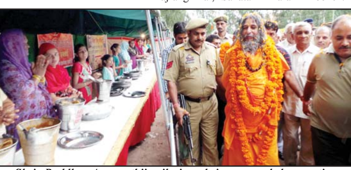
Shri Buddha Amarnathji pilgrims being accorded reception at Sunderbani on Friday.