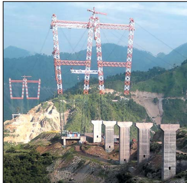
Cable cranes installed across river Chenab to facilitate erection of arch of upcoming world's highest Railway bridge.