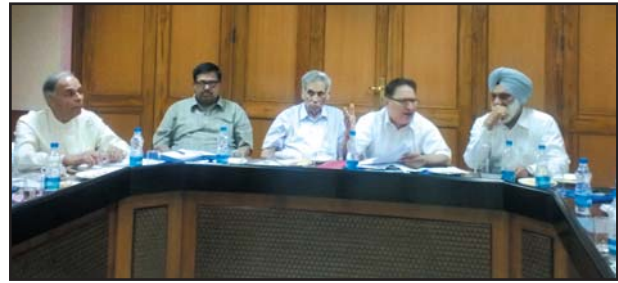
PAC members discussing Technical Programme details of Indian Science Congress at New Delhi.

In the end, it was resolved that National president will approve the Technical