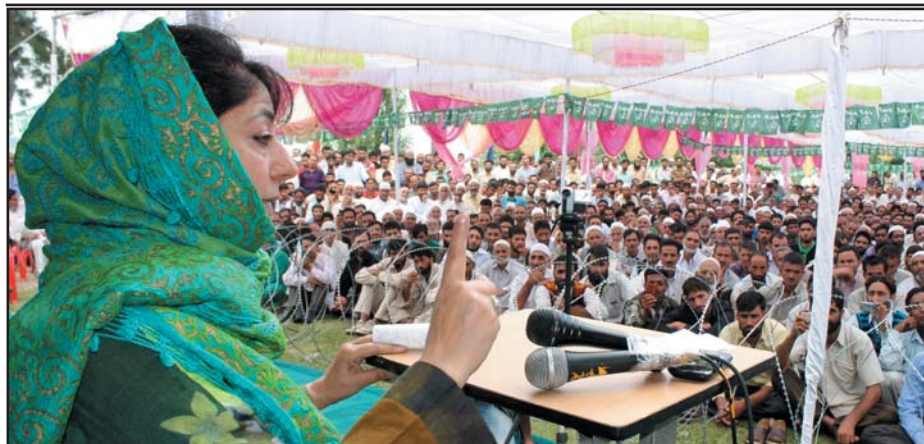
People's Democratic Party president Mehbooba Mufti addressing a public rally at Shopian on Sunday.