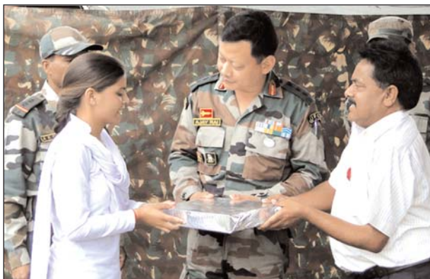
A student being felicitated by the dignitaries during debate and essay writing competition organized by Army at Kalakote in Rajouri.

"He (Dhoni) is a guy who doesn't say much. But I keep talking to him about different situations and what I could do and how should I keep myself calm in pressure situations while captaining the side. It helped me chatting to him in the West Indies when he wasn't playing and I was captaining the side. All the tips he gave me really helped me," Kohli said. (PTI)