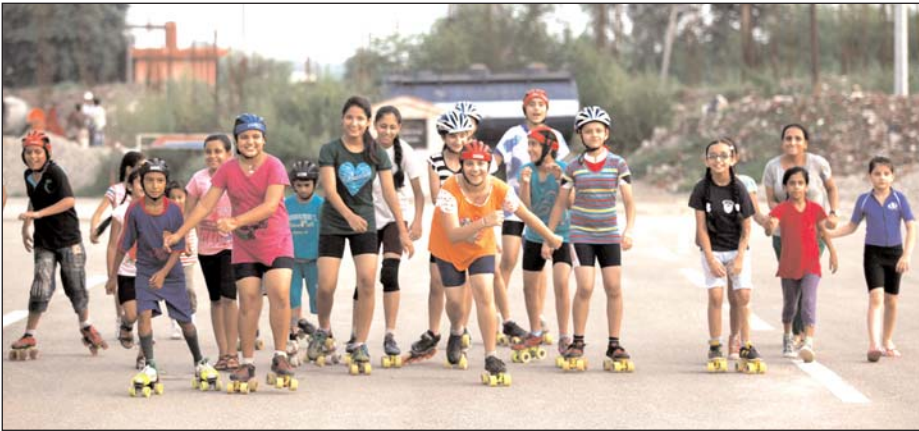
Skaters enjoying a ride and sighing relief after sweating-it-out in a hard fought Inter-School Skating Competition at MA Stadium in Jammu on Wednesday.