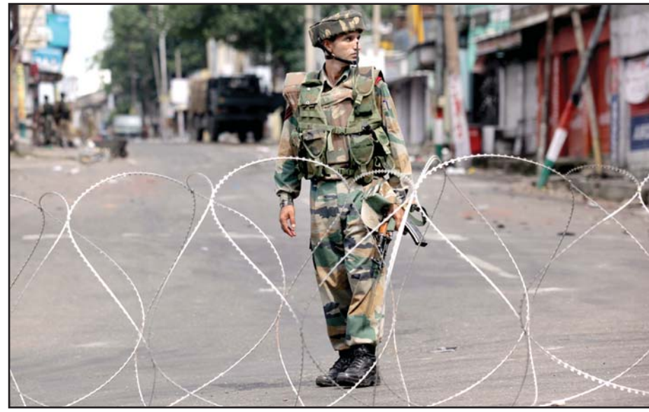
An Army soldier guards Jammu city during curfew on Sunday. More pics on page 3 and 4.