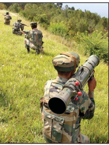
Troops take positions during firing at LoC in Balakote sector. Another pic on page 4. Pakistani forward posts were involved in the firing. No casualties or damage was reported on Indian side in the (Contd on page 4 Col 1)

in New Delhi, they added. Two BSF jawans were injured in Pakistani firing at Hiranagar and Ramgarh sectors few days back. Meanwhile, Pakistan Army resorted to heavy firing at about dozen forward Army posts at Balakote, Mendhar and Mankote sectors in Poonch district between 10.30 am to 2 pm today. Sources said Pakistan Army used heavy fire arms in targeting forward Indian pickets. Troops effectively retaliated to silence Pakistani guns. The firing stopped around 2 pm. Sources said at least eight