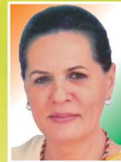
Smt. Sonia Gandhi Hon'ble Chairperson, UPA

On the Occasion of Independence Day 15th August, 2013