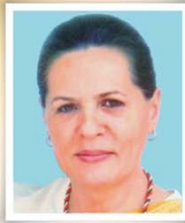
Smt. Sonia Gandhi Hon'ble Chairperson, UPA