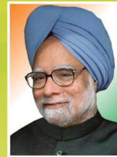
Dr. Manmohan Singh Hon'ble Prime Minister of India