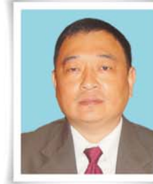
Shri Ninong Ering Hon'ble Minister of State for Minority Affairs

Nation Celebrates Real Spirit of Independence