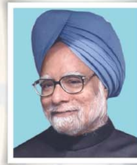
Dr. Manmohan Singh Hon'ble Prime Minister of India