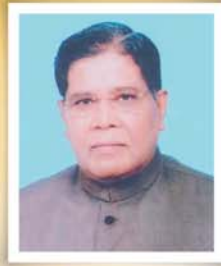
Shri K. Rahman Khan Hon'ble Minister of Minority Affairs