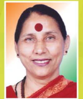
Smt. Krishna Tirath Hon'ble MOS (IC), WCD