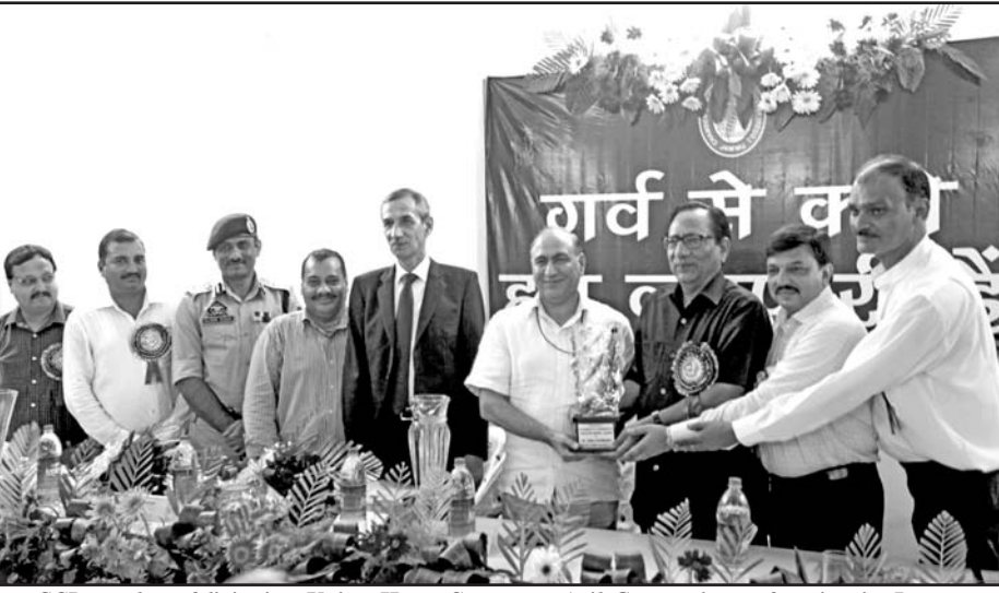
CCI members felicitating Union Home Secretary, Anil Goswami at a function in Jammu on Friday.