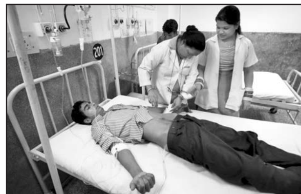
A civilian injured in Poonch firing being treated at GMC Jammu on Friday.