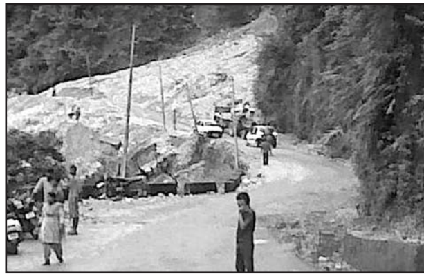
Katra-Reasi road blocked due to landslides on Friday.

The people of Poonch area also held protest demonstration