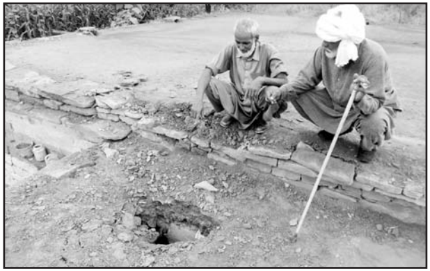
Villagers watch a crater caused due to shelling by Pakistan Army in Mendhar sector on Sunday.

side in firing and shelling by the Pakistani troops while as there were confirmed reports of the killing of three Pakistan Army personnel and injury to many others. Sources said the Pakistan Army was now deliberately targeting the civilian areas to force migration of the people so that pressure was built on the Indian Army to stop firing. However, they added, the civilians in the forward areas were standing like a rock and have been asking the Army to give effective reply to Pakistani firing. The civilians were determined not to leave the villages in forward areas. Sources said the Pakistan Army has been frequently firing 82mm mortars with a range of three to four kilometers with a view to target the civil population. There have been 17 ceasefire violations by Pakistani troops in past nine days, Army officials said. Seventy ceasefire violations by Pakistani troops have taken place this year from January 1 to August 5, which is 85 per cent more than those during the same period last year, they added. Meanwhile, sending a strong message to Pakistan over repeated ceasefire violations and BAT attacks, a top Army commander today warned it was making a "serious mistake" and said a befitting reply would be given with "full force" at the time and