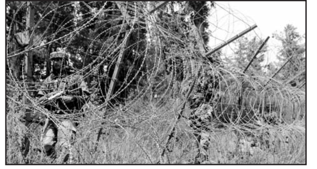
Troops patrolling near a barbed wire on LoC in Keran sector of North Kashmir's Kupwara district.