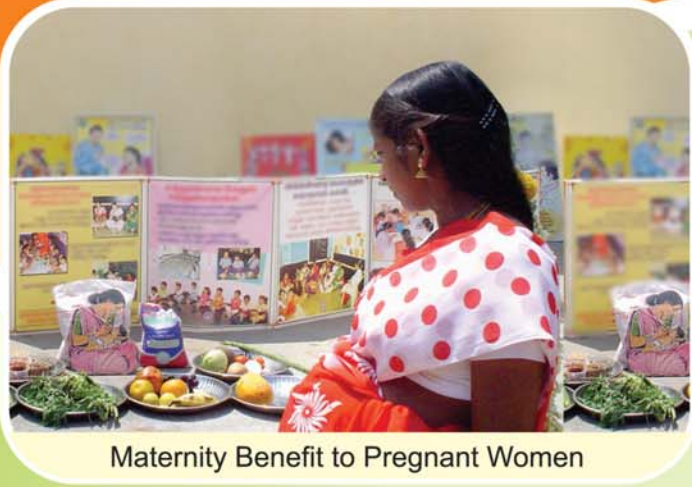
Maternity Benefit to Pregnant Women