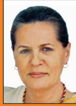
Smt. Sonia Gandhi Hon'ble Chairperson, UPA