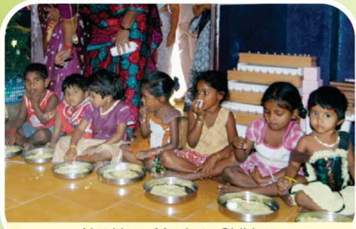
Nutritious Meals to Children