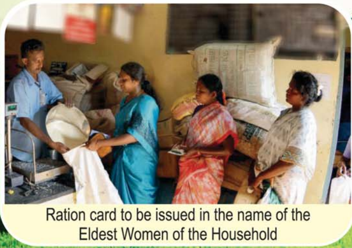
Ration card to be issued in the name of the Eldest Women of the Household