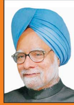
Dr. Manmohan Singh Hon'ble Prime Minister of India