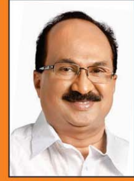
Prof. K.V. Thomas Hon'ble Minister of State (IC) Consumer Affairs Food & Public Distribution