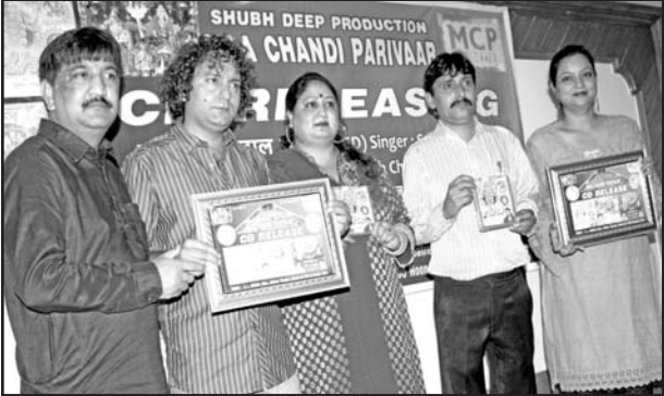
Bhajan videos being released at KL Sehgal Hall, Abhinav Theatre at Jammu.