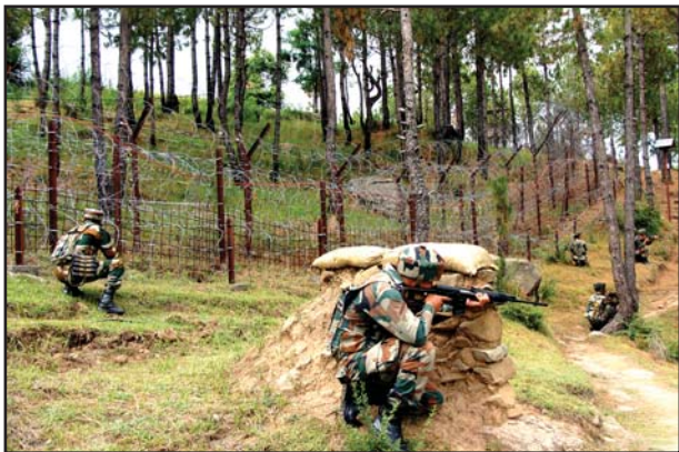
Ready To Retaliate: Army jawans take positions in Balakote sector. (Another pic on page 7).

tonight sending a wave of panic and fear among the people putting up in forward areas of Manjakote sector, bordering villages Tarkundi and Dadot of Balakote sector in Poonch district.