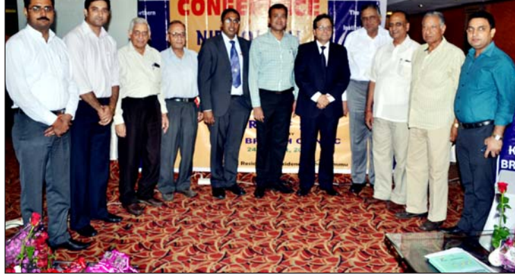
Dignitaries during Sub-Regional Conference organised by J&K branch of ICAI at Jammu on Saturday.

Regional Council (NIRC) of Institute of Chartered Accountants of India (ICAI) hosted Sub-Regional Conference today.