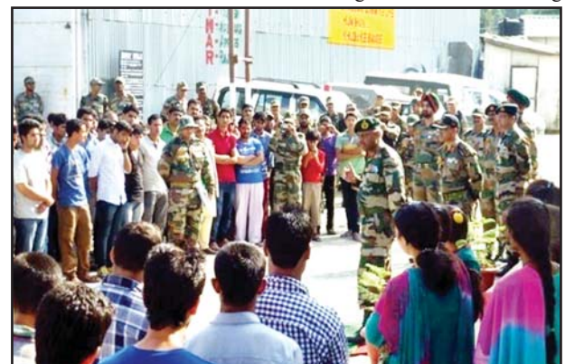
Army officials seeing off Kishwar youth who have been facilitated with free education at Pacific University, Udaipur in Rajasthan.

During the Flagging in ceremony the enthusiasm and excitement was writ large on the faces of the young and effervescent children who wanted to share their vivid and memorable experiences with one and all present at the venue. The civil administrative officials and relatives of the youth were present to greet the tour.