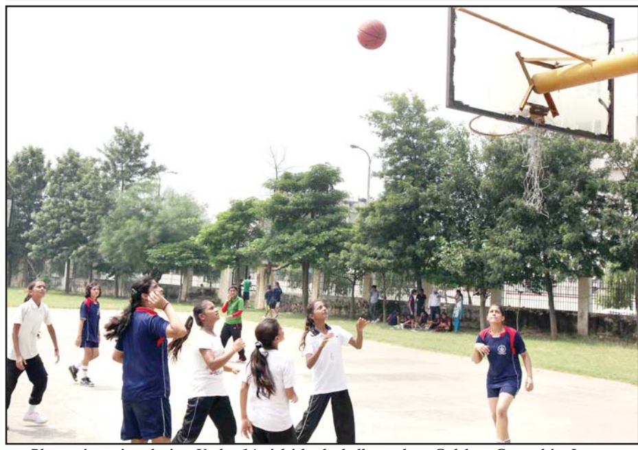
Players in action during Under-14 girls' basketball match at Gulshan Ground in Jammu on Tuesday.