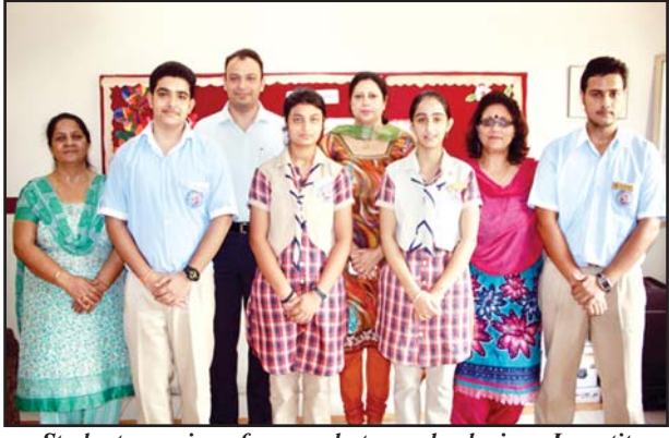
Students posing for a photograph during Investiture Ceremony organized by Model Academy.