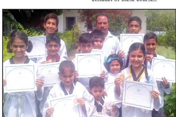
Students of Lawrence Public School holding certificates while posing for a photograph.

The Principal, Medical Officer, staff and the Instructors of the Institute are presently in Kargil in connection with the conduct of these courses.