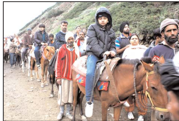
Pilgrims on way to the Amarnath cave shrine near Dhulian in Sonamarg.

Chandanwari track early this morning under tight security arrangements. These pilgrims after a night halt at Shesh Nag