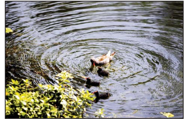
A mother duck feeds her ducklings in a pond at Srinagar on Sunday.