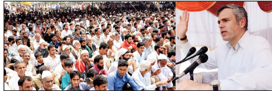
Chief Minister Omar Abdullah addressing a public meeting at Kanir on Sunday.

Centre for its failure to take follow up action on the report of Interlocutors, Omar said the Interlocutors had held a series of meetings with stakeholders and had appointed the Interlocutors to look into political problems of the State and suggest a viable solution, the Chief Minister said: "the