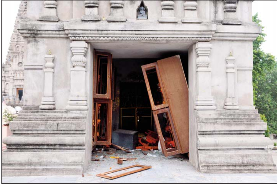
The debris inside the temple after the bomb blast at the World Heritage Mahabodhi temple premises in Bodh Gaya on Sunday. (UN)

today, with suspected Indian Mujahideen operatives simultaneously triggering nine low intensity bombs leaving two monks injured.