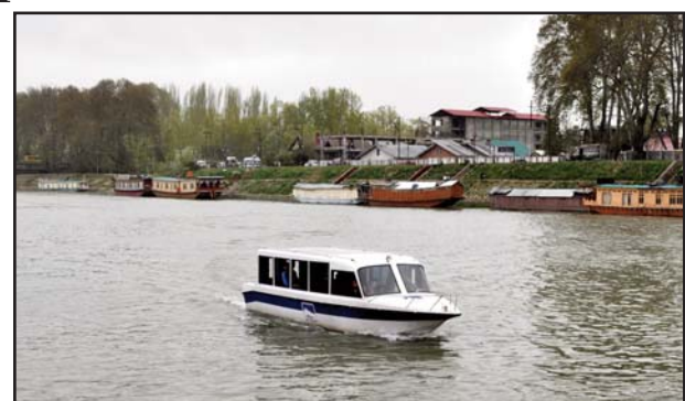
A cruise paddles in the waters of Jhelum river in Srinagar.

But the company head Ufair Ajaz said this mode of transport cannot ease traffic congestion as necessary infrastructure to run the service is yet to be made available due to lackadaisical approach of the Government.