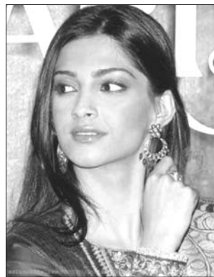
"All I can say is that my role is integral to the film. Hence, I cannot reveal it now," Sonam said.

Sonam, however, refused to reveal much about her role.