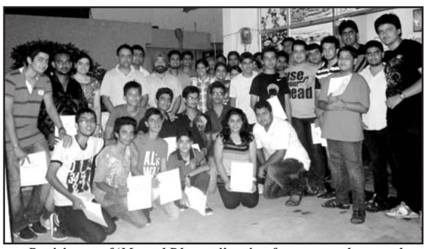
Participants of 'Mangal Dhawani' posing for a group photograph.