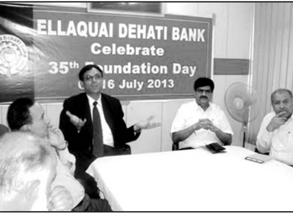
Dignitaries during foundation day of EDB on Tuesday.

Excelsior Correspondent JAMMU, July 16: To celebrate 35th foundation day of Ellaquai Dehati Bank (EDB), functions were held at its district headquarters, regional