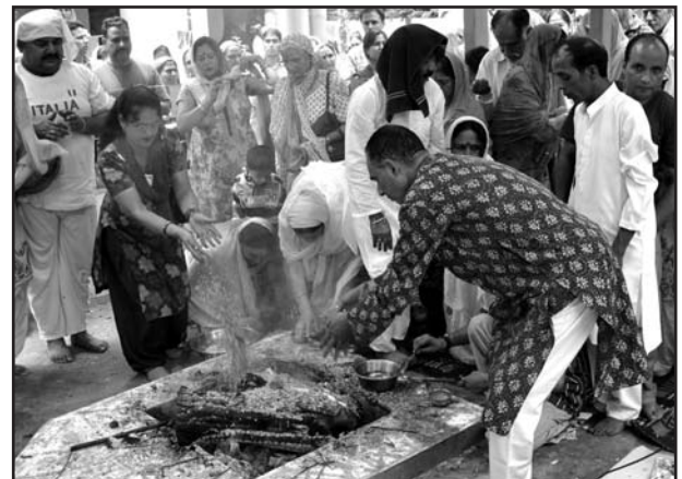
Kashmiri Pandits during annual Mahayagya at historical Mata Katyayani temple at village Kakran in Kulgam district on Tuesday.