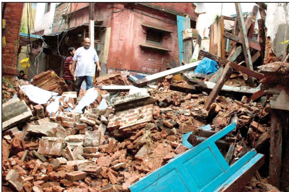
A house which collapsed during rain at Kalijani in Jammu on Saturday. More pics on page 3 & 4.

Three persons were killed and fourteen others including driver were injured. DC Poonch