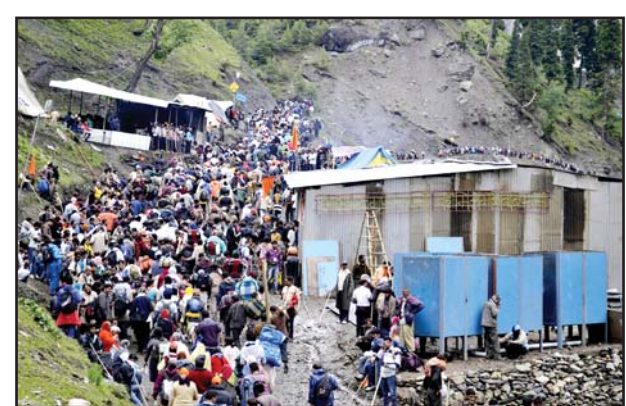
Pilgrims assemble at Chandanwari camp before leaving towards Jammu on Saturday.

He said likewise the yatris who left Jammu base camp for holy cave will be allowed to