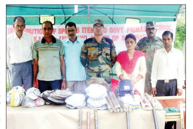
Army officers posing for a photograph alongwith staff of Primary School, Kachha, Bhawani in Rajouri on Tuesday.

A total of 29 matches will be played in the USD 6 million tournament.