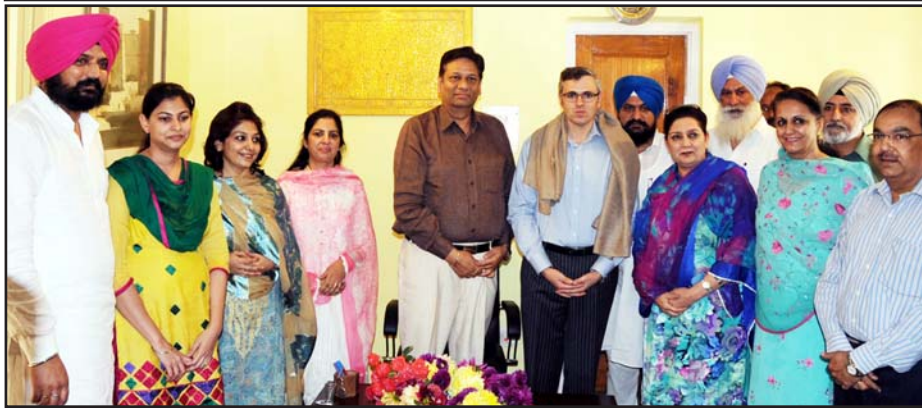
Chief Minister Omar Abdullah alongwith members of Public Accounts Committee of Punjab Assembly at Srinagar on Thursday.