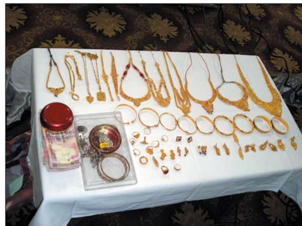
Gold ornaments recovered from burglars.