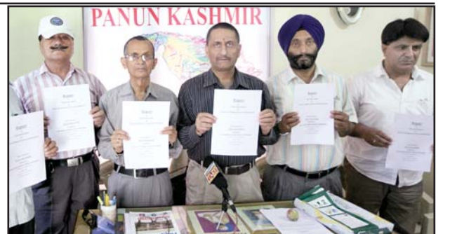
PK leaders releasing document on threats posed by surrendered policy at Jammu on Tuesday.