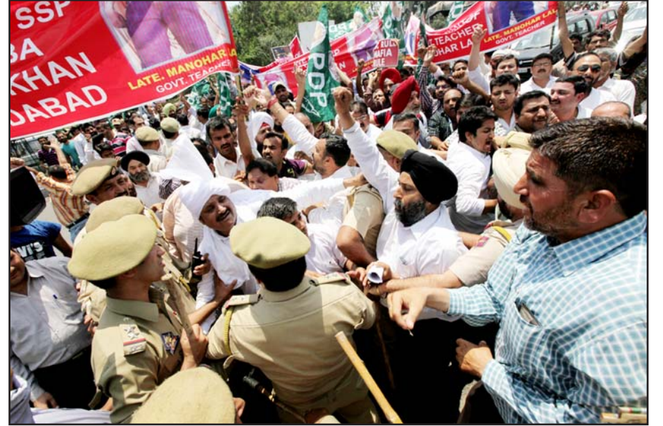
PDP activists taking out protest rally at Jammu on Thursday.