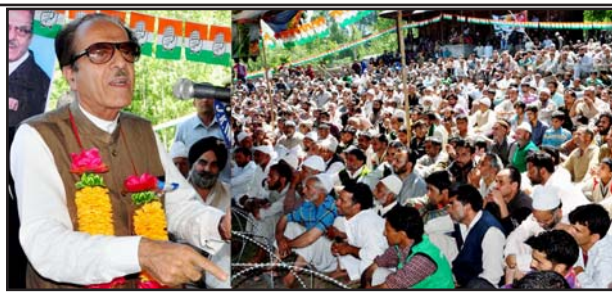
PCC president Prof Saif-ud-Din Soz addressing a public meeting at Shanglipora on Thursday.