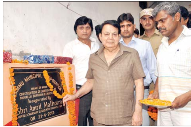
Chairman Legislative Council inaugurating lanes and drains at Mohalla Bhatrian Jammu.

The National Head-Legal operations of the company appeared in person to justify the violations & submitted reply which was not accepted by the department and the company was booked for further legal proceedings in the interest of consumers.