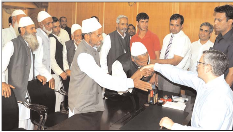
Chief Minister Omar Abdullah interacting with a deputation during Awami Mulakat at Srinagar on Monday.