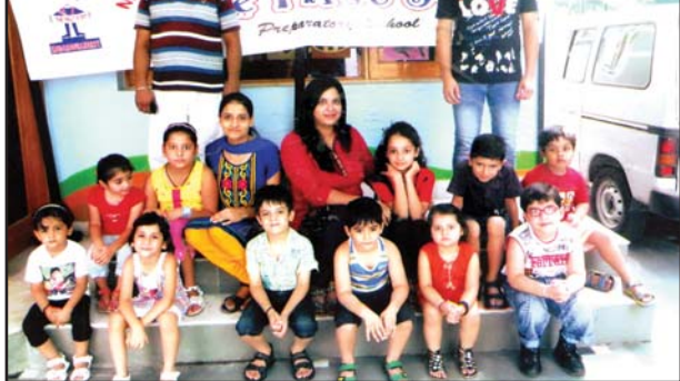
Winners of various events posing for a photograph during valedictory function of the Summer Camp organized by Diamond Institute.