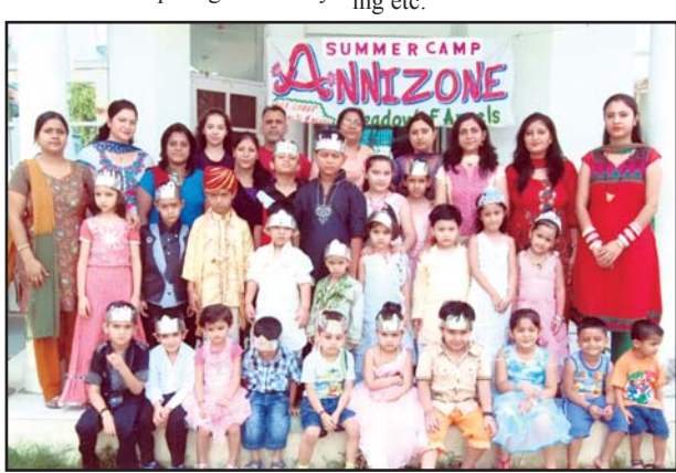
Children along with officials and trainers posing for a photograph during the closing function of the Summer Camp.

JAMMU, June 25: 15-days Summer Camp organized by