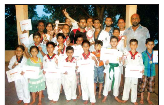
Taekwondo players holding certificates in their hands while posing for a group photograph.

Asked about the next 50-over World Cup, Ganguly, under whom India became a force to reckon with in international cricket by winning Test matches abroad, said, "I am sure he has got the 2015 WC at the back of his mind. He is young, a terrific ODI player and there is no reason why he won't be captain."