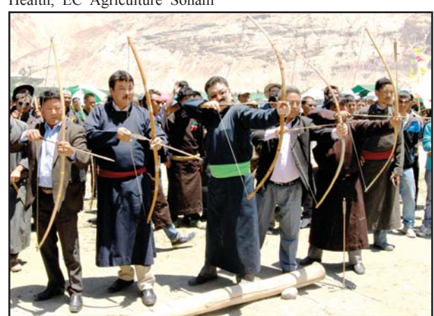
Archers aiming at target during Silk Route Festival in Leh on Tuesday.