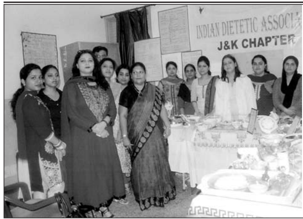
Dignitaries during National Nutrition Week programme at GMC, Jammu on Saturday.