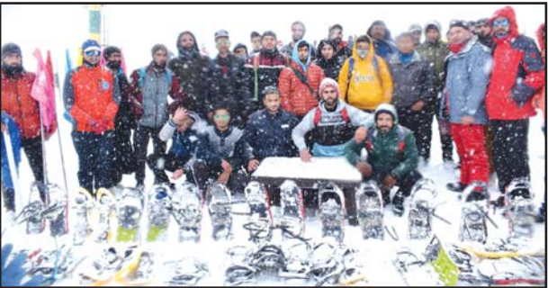
Participating players posing for a group photograph at Gulmarg.