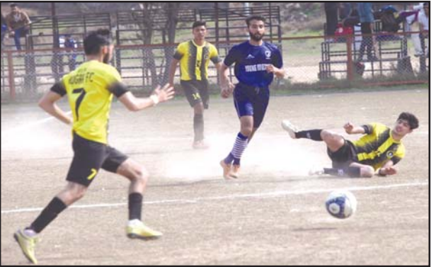
Football players in action during a match at GGM Science College Ground, Jammu.