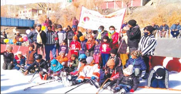
Ice Hockey players posing for a group photograph during culmination of camp at Kargil.