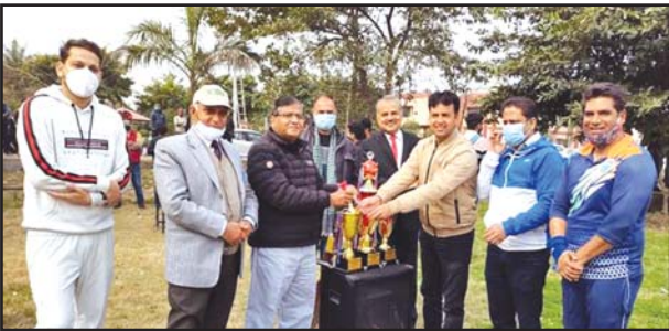
Vice Chancellor SKUAST-Jammu during inauguration of T-10 Cricket Tournament at Mani Campus Chatha in Jammu.