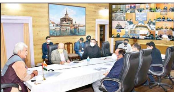
Lieutenant Governor Manoj Sinha reviewing winter management in Jammu on Sunday.

Due to declaration of heavy snowfall as a natural calamity, processing of ex-gratia relief under SDRF will become faster, thereby giving a huge relief to the affected public of snow