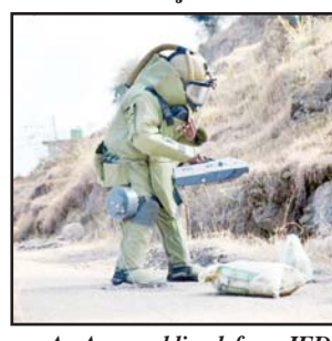
An Army soldier defuses IED in Mendhar on Sunday.

district and intensify militancy in the twin border districts of Poonch and Rajouri. ed by police on the basis of disclosures made by three already arrested militants from Mendhar and Balakote areas of Poonch district, taking total arrests in the area to seven. All four newly arrested militants hailed from the areas close to the Line of Control (LoC) and had fallen into the trap of militants on being lured by the militant commanders operating from Pakistan and Pakistan occupied Kashmir (PoK). Explosive devices including