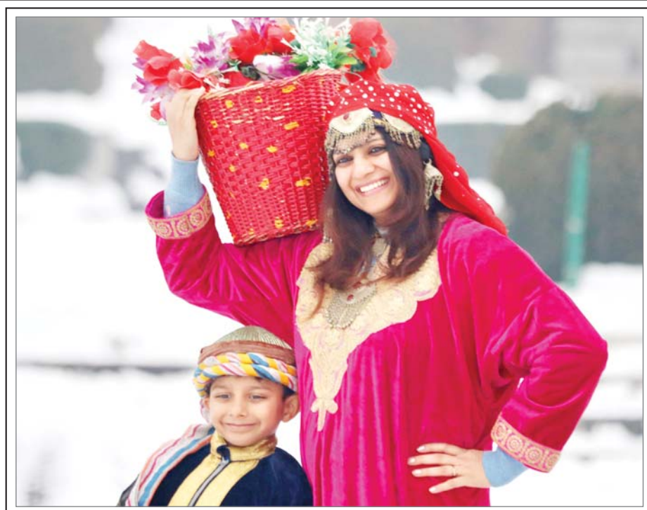
Tourists pose for photograph in traditional attire at Nishat garden in Srinagar.