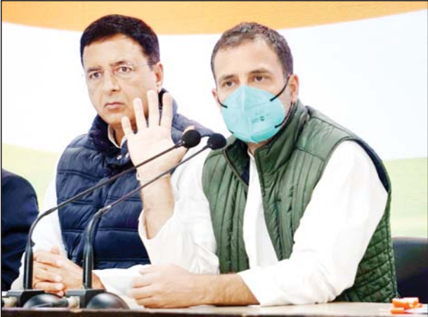
Congress leader Rahul Gandhi addressing a press conference on Tuesday.

"The last bastion that was protected by monopoly is being over-run and the three new laws that have been passed, are designed to destroy Indian agriculture, by destroying mandis, by destroying essential commodities act and by making sure that no Indian farmer