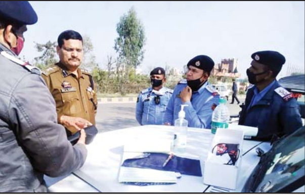
Traffic Police Rural Jammu starting e-challaning system.