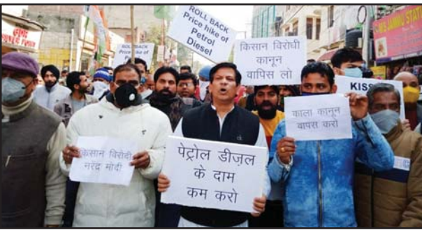
OBC Cell of PCC staging protest in Jammu on Tuesday.