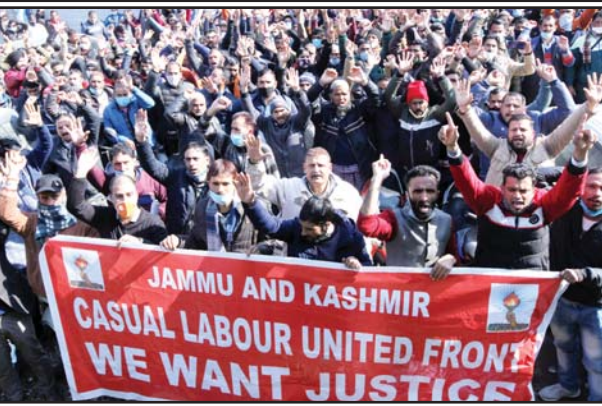
Casual labourers staging protest in Jammu on Tuesday.

Gandhi Nagar Police has taken cognizance in this regard.