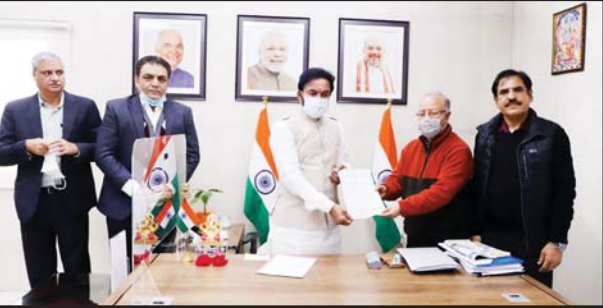
GKPD representatives submitting a memorandum to MoS Home, G K Reddy in New Delhi on Tuesday.