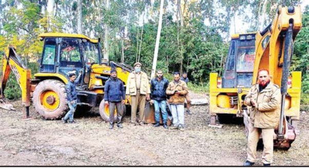
Two JCBs seized by Forest staff in Kalakote.