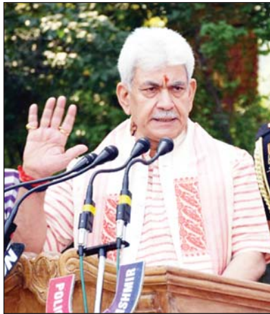
Lieutenant Governor Manoj Sinha speaking at an event 'Pedal for Peace' organized by Jammu and Kashmir Police in Srinagar.

*Milestones, roads to be named after martyrs from Sept 30