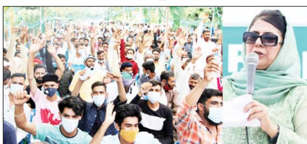
PDP president Mehbooba Mufti addressing party workers rally in Jammu on Sunday.

"PDP will fight the elections. So far, an alliance is concerned, the question is premature but one