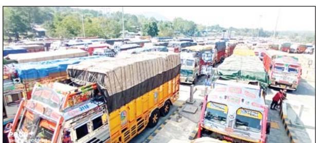
Trucks stranded at Toll Plaza Qazigund.

"We thought that with the improvement in the condition of the road along with the opening up of the tunnel, the travel would