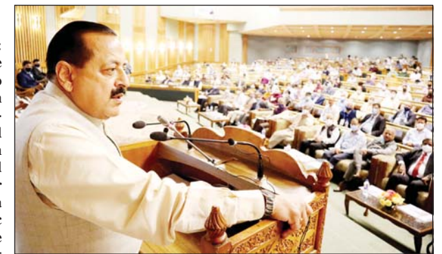
Union Minister, Dr Jitendra Singh addressing inaugural session of CSIR workshop at Srinagar on Sunday.

"Indians have had a strong scientific temper for ages and we have talent in abundance and with this India is bound to be the world leader in the technological