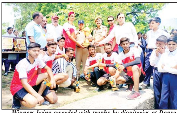
Winners being awarded with trophy by dignitaries at Dansal on Friday.