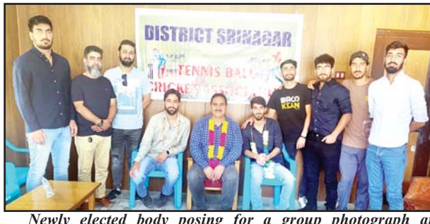
Newly elected body posing for a group photograph at Srinagar.