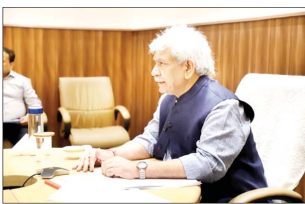
LG Manoj Sinha addressing the Vigilance Awareness Week function on Monday.

On the occasion, he also extended his greetings to the people on Rashtriya Ekta Diwas and paid tribute to Bharat Ratna