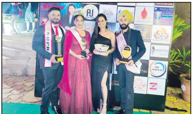
Winners posing for a group photograph after the event.

I had the idea of doing a yatra when I was 25, where I was not even entered into politics. This journey is a great experience for learning a lot, the former Congress President said. (UNI)