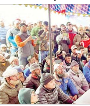
NC vice president, Omar Abdullah addressing party workers at Drass in Kargil on Monday.

SRINAGAR, Oct 31: The Jammu and Kashmir National Conference, vice president and former J&K Chief Minister, Omar Abdullah today said that boundaries drawn between J&K and Ladakh 'New Delhi' on August 5, 2019