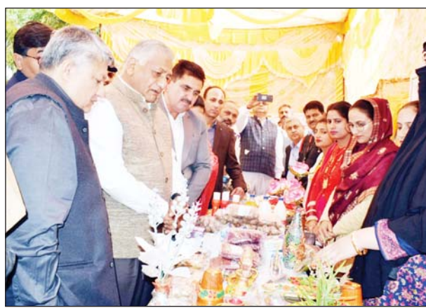
Union MoS for Road Transport, General V K Singh inspecting stalls during prog at Doda.

are void of people's mandate and will not stop them from speaking up for the region. He said the boundaries that have been forced on people have failed to divide them. Omar also said that the party's MPs have been raising the issues