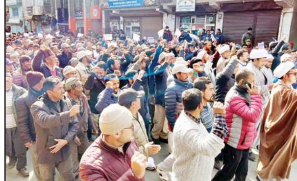
People protesting in Kargil on Wednesday. Another pic on page 4.

framing of Recruitment Rules for which President of India Droupadi Murmu has conferred powers to Lieutenant Governor of