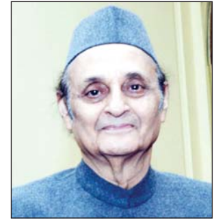
Union Minister Kiren Rijiju's "hit job" on Jawaharlal Nehru's role in J&K's accession to India.

Ramesh on Thursday had criticised Singh for "sidestep-