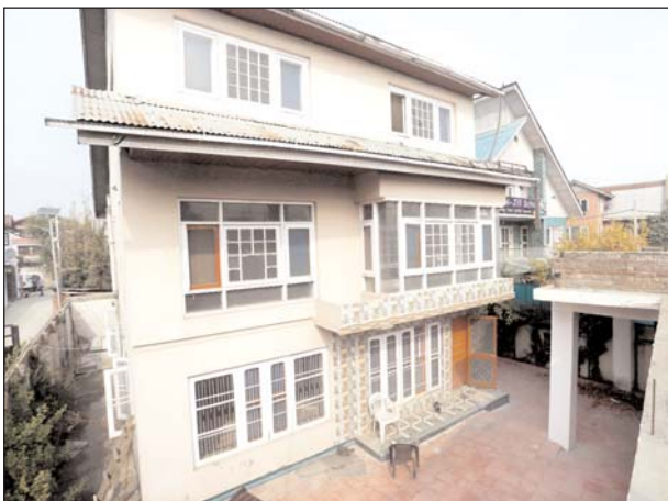
Shabir Shah's house in Sanat Nagar which has been attached by Enforcement Directorate.