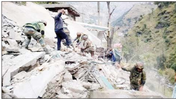
Police and Army team engaged in rescue operation after landslide hit a house in Surankote area of Poonch on Friday.