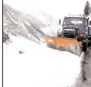
BEACON machine clearing accumulated snow from Srinagar-Leh road at Zojila Pass on Sunday.

SRINAGAR/JAMMU, Nov 6: Higher reaches of Kashmir received fresh snowfall while light to moderate